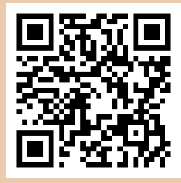
How can you participate? - Join a focus group. - Listen and share podcast.

Your stories will help us develop our final recommendations.